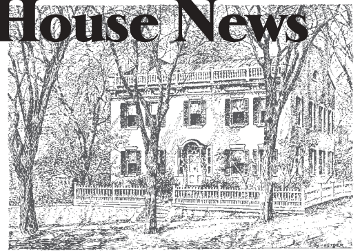
Early sketch of the house Horatio Seymour built in 1816