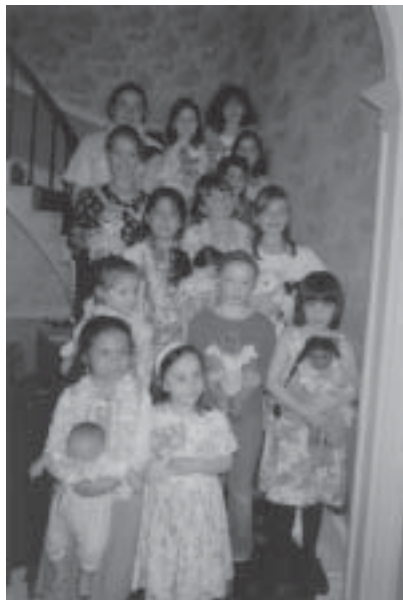
The children and their guests lined up on the circular stairs in the entry of the Community House.