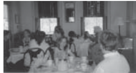
Tables were decorated with spring pastel colors. The young people and their parents enjoyed great food and conversation.